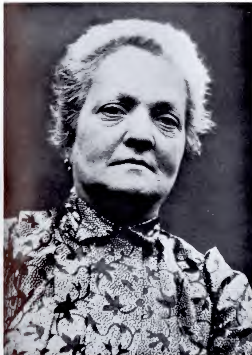
EUSAPIA PALLADINO After Courtier and by permission of the Institut General Psychologique